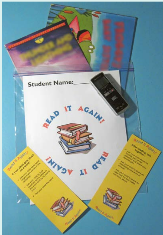
Figure 3 Sample bag and contents